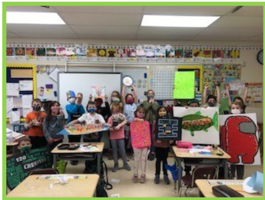
First grade students with their 120-day school projects.